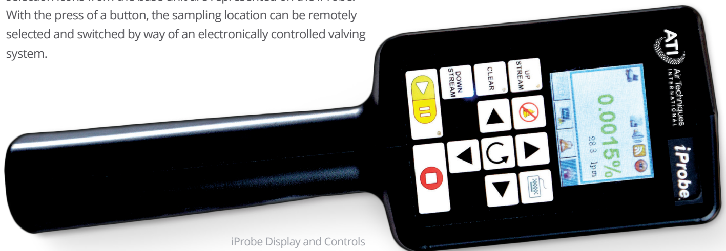
iProbe Display and Controls