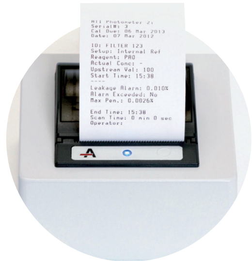
Optional Printer & Sample Report

The iProbe with a 12 ft cable acts as an extension of the base instrument through a nearly identical user interface. All status and selection icons from the base unit are represented on the iProbe. With the press of a button, the sampling location can be remotely selected and switched by way of an electronically controlled valving system.